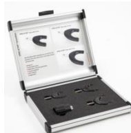
Spine applicator set