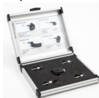
Fascia applicator set