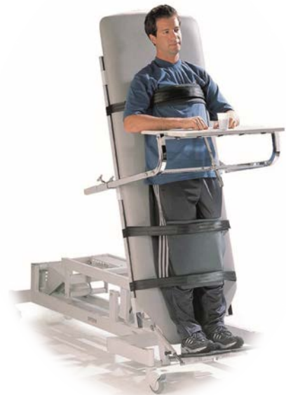
Optional work top