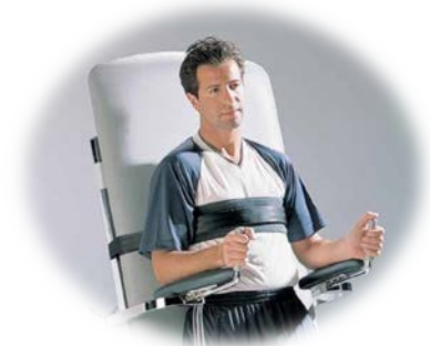
Optional arm rests